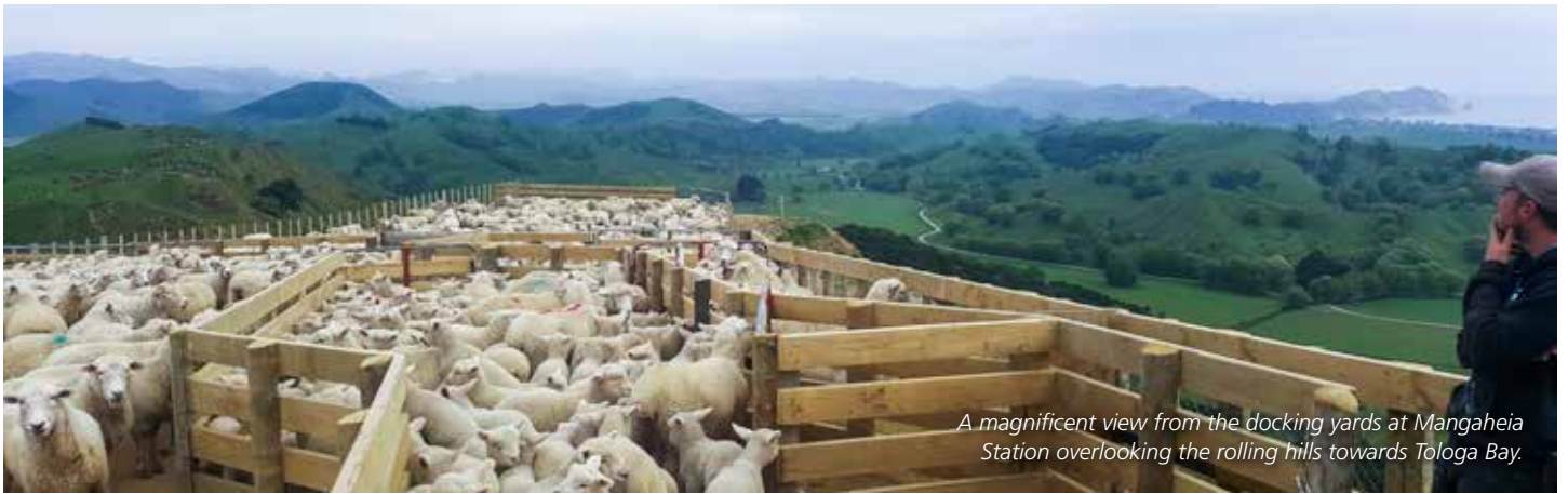
A magnificent view from the docking yards at Mungaheia Station overlooking the rolling hills towards Tologa Bay.