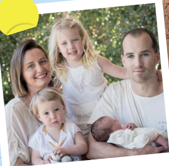
The Shearson Family